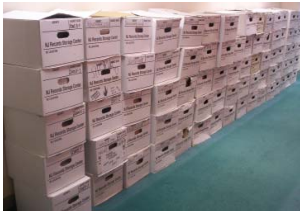
Figure 1. A common means of data storage even in 2005 in many agencies.

This overview introduces the reader to the basic concepts of Data Management, Analysis and Visualization Techniques (DMAVT). In 2004, the Interstate Technology and Regulatory Council (ITRC) Remediation Process Optimization (RPO) Team developed a technical regulatory guidance document titled, Remediation Process Optimization: Identifying Opportunities for Enhanced and More Efficient Site Remediation . Based on feedback to the RPO training and continued research into the topic, the RPO team identified the need for detailed information on DMAVT. Data Management, Analysis, and Visualization Techniques in some ways are important tools in successfully measuring the progress of a remediation or a monitoring program. This overview will further develop the basic concepts of DMAVT and their potential application to site rehabilitation projects.