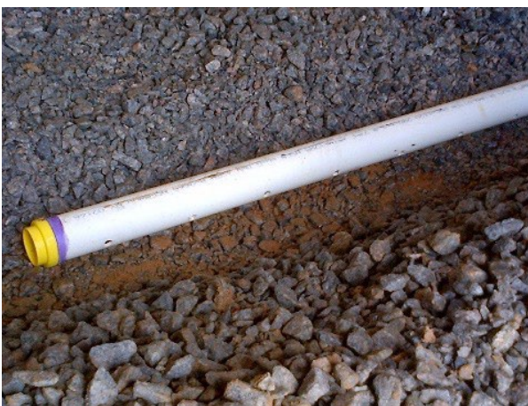
Figure 4. Photograph of mitigation system piping.