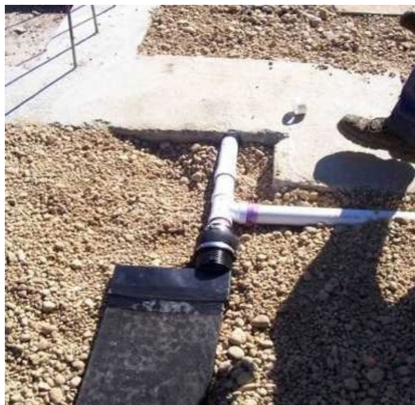
Figure 3. Photograph of a low-profile vent and vent pipes.