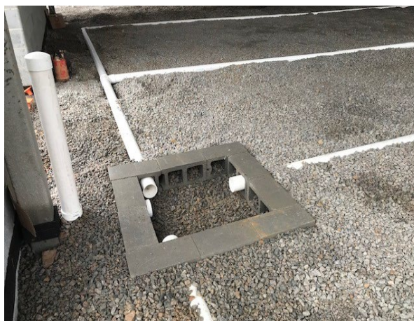
Figure 5. Photograph of a header for mitigation system piping.